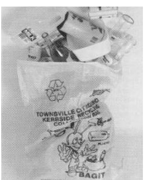
Responding to the community's wishes, Council has initiated a recycling scheme for metals, plastics and glass.

The effective management of solid waste is currently limited by a number of factors. Whilst it is possible for local government to deal with solid waste in the traditional manner (by securing it in landfill sites), the cost-benefit ratios of recycling and reprocessing schemes are usually not economic at the local level, particularly in north Queensland where transport costs to southern plants and markets can be prohibitive. It is suggested that greater proactive involvement by the State and Commonwealth Government in developing integrated schemes covering these areas is required to overcome this problem. Greater uptake of recycled products by domestic and commercial consumers, and involvement in recycling schemes, would enhance the economics of waste minimization. Naturally, overpackaging and reliance on non-recyclable products has a negative impact on waste minimization.