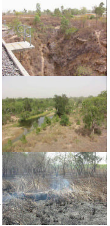
Figure 3-1 Example Issues